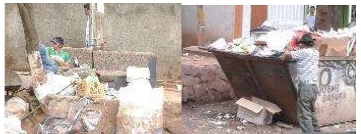
This is driving by on a main Street. A man sits on a junk couch guarding his treasures of plastic and cardboard while another man digs in the dumpster.