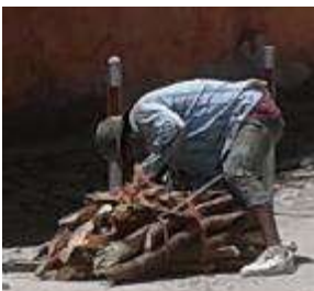
People gather stacks of wood to carry on their backs to use or sell.