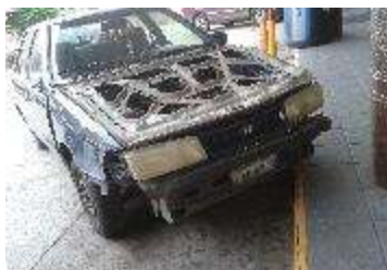
It's legal to drive a car without bumpers. This one had the top of the hood missing